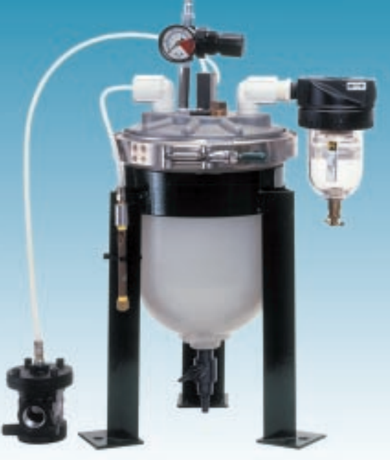
U.S. Patent #5,501,577 Eliminate Costly Downtime & EPA Reporting

The Spill-STOP's patented design safely captures leaked product while effectively shutting down failing pumps. Optional warning alarm and backup pump switchover further ensures maximum productivity and minimal system downtime.